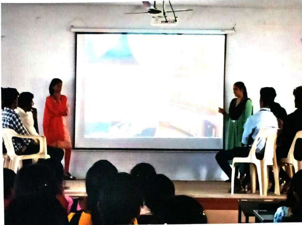
Students attending technical quiz – First Round