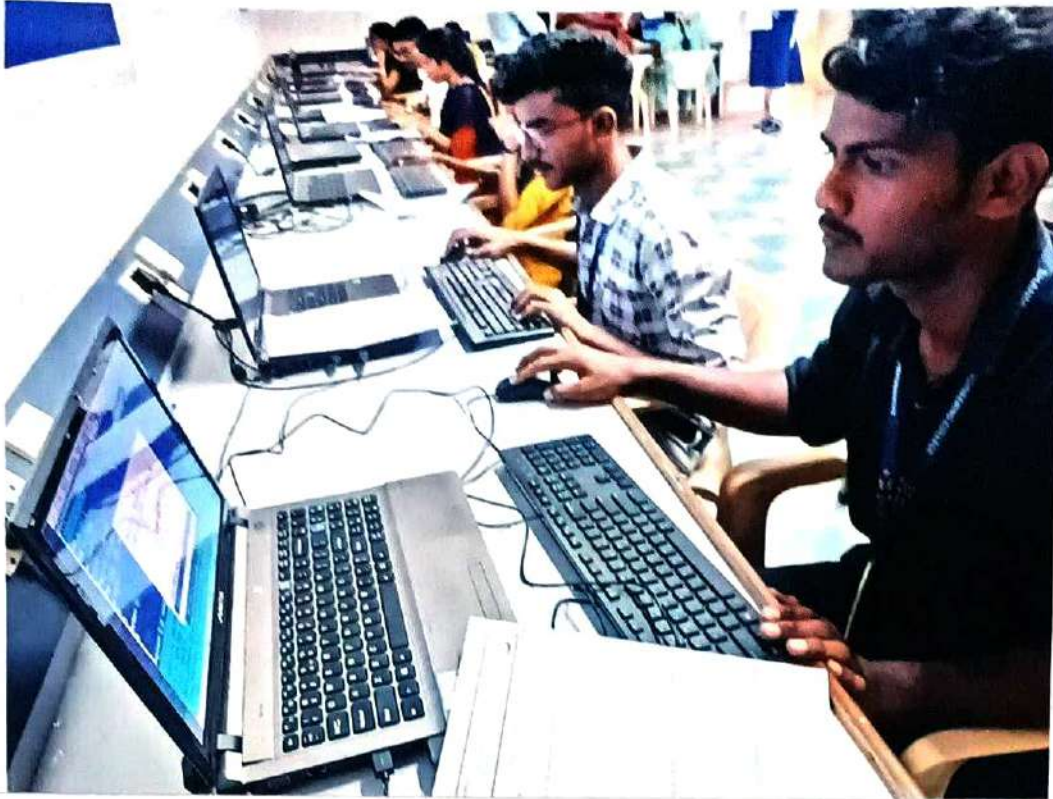
Students attending debugging in 'C' – First Round