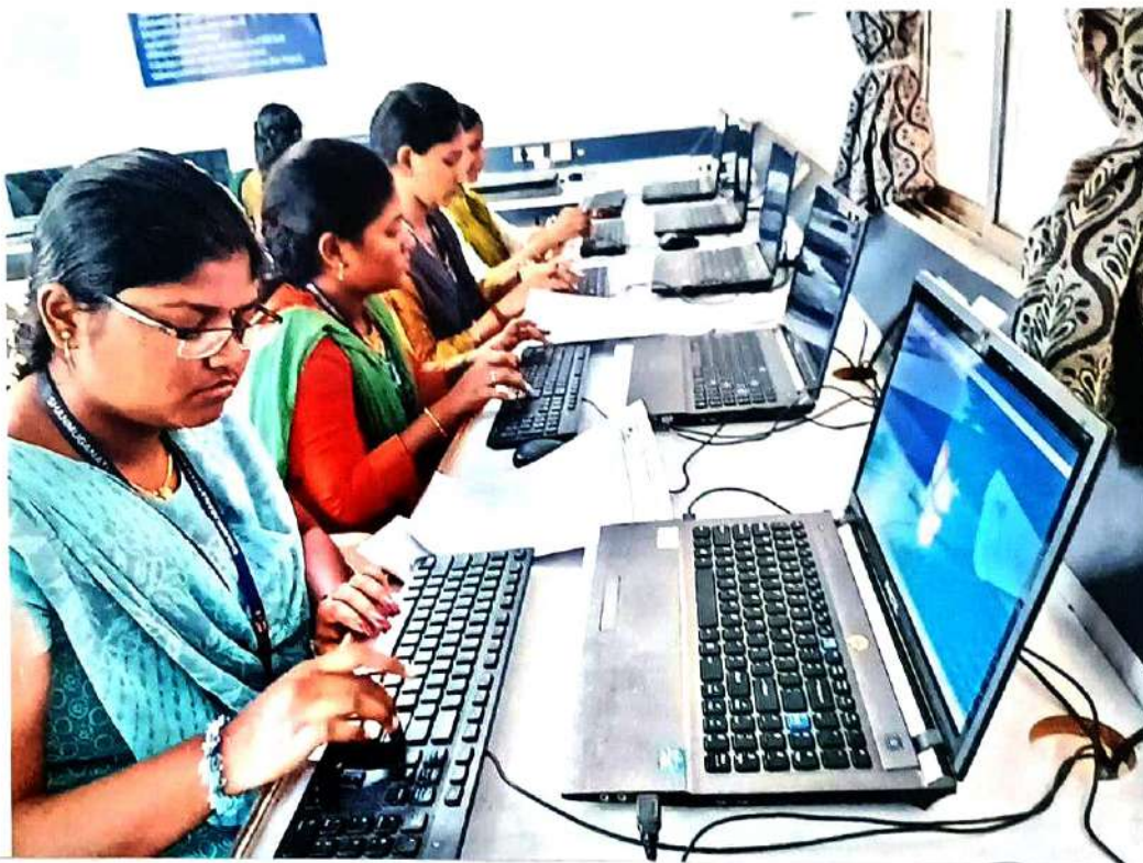
Students attending debugging in 'C' – Final Round