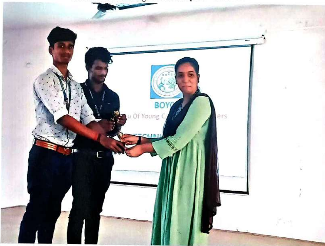
Winners of Technical Quiz contest: